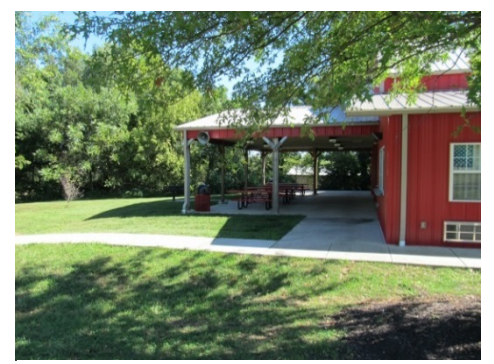
Lean-to Pavilion-Existing Conditions

Lean-to Pavilion - Proposed Improvements : This pavilion can be used for medium sized gatherings with the option to