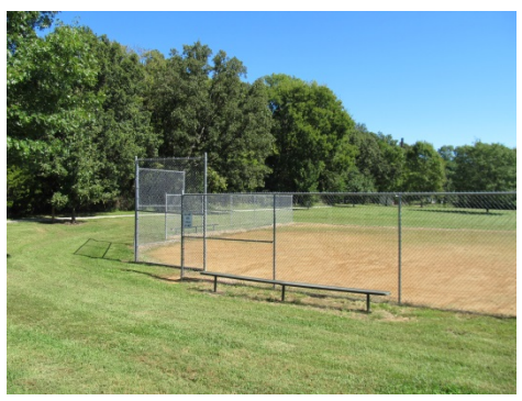
Baseball Field 2-Existing Conditions

Baseball Field 2 - Existing Conditions : The existing baseball field known as "Field 2" is used as a practice field for kids between the ages of 4-8 years old. The field has two benches that act as dugouts, but no other significant seating is available for spectators. However, a picnic table and bench are available for spectators, and there is room for lawn chairs to be placed around the field without crowding the walking trail.