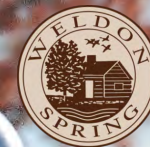
IMAGE UPDATE COMING 3/19