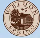
IMAGE UPDATE COMING 3/19