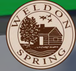
IMAGE UPDATE COMING 3/19