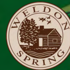
IMAGE UPDATE COMING 3/19