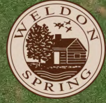
IMAGE UPDATE COMING 3/19