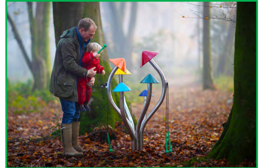
Nature Bells (6x)