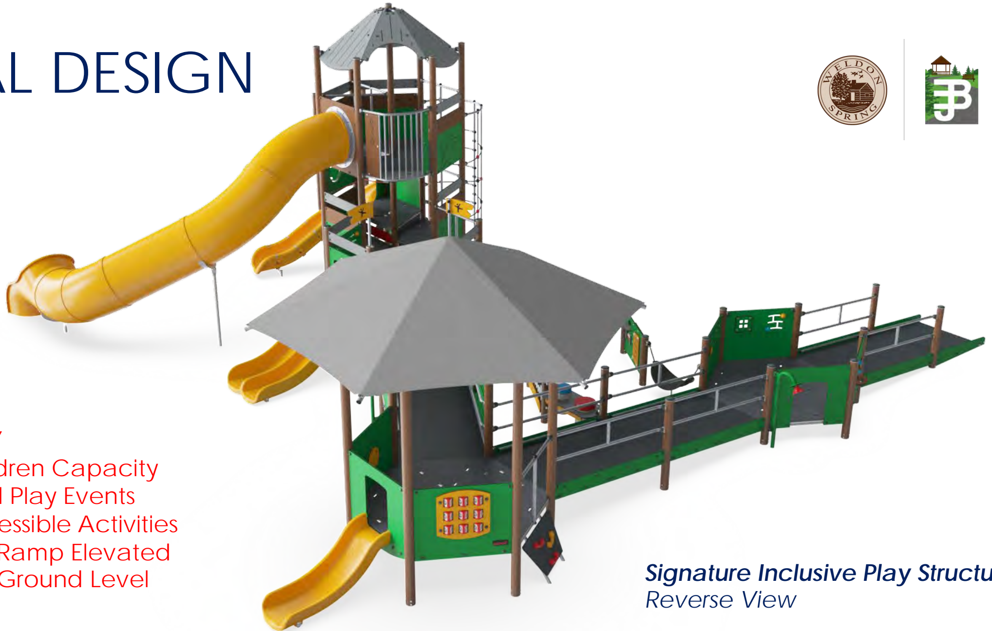
Signature Inclusive Play Structure Reverse View