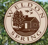
IMAGE UPDATE COMING 3/19