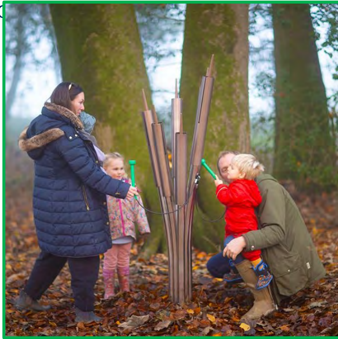
Cattail Chimes (6x)

The updated, Final Design also accounts for selection of a Creative | Sensory Play piece. This piece will be placed at the New Structure. PRAC + City to select one of the following: