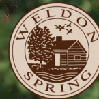
IMAGE UPDATE COMING 3/19