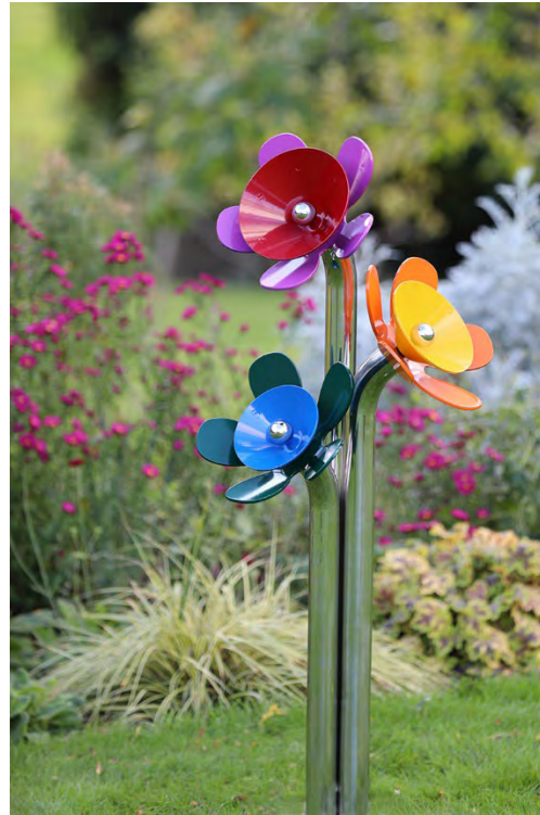
Harmony Flowers (6x)