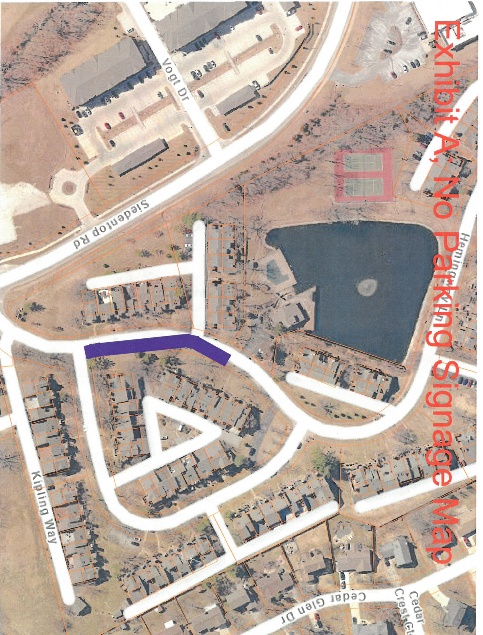
Exhibit A: No Parking Signage Map