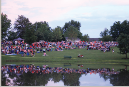
A packed park on 7/4/19

a joy to celebrate our country as one community. This fall we will host two great events. On September 13, we will have our annual Senior Citizen Appreciation day. We encourage our senior citizen community to join us at City Park for this wonderful event. Festivities will begin at 3PM and run until 6PM. Come for late BBQ lunch, prizes, and live music. We hope to see you at this fun fall celebration. On October 4th we will host a ribbon cutting and outdoor movie night. For additional information visit weldonspring.org