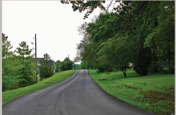
Sammelman Rd. on 8/23/19 by B. Spence